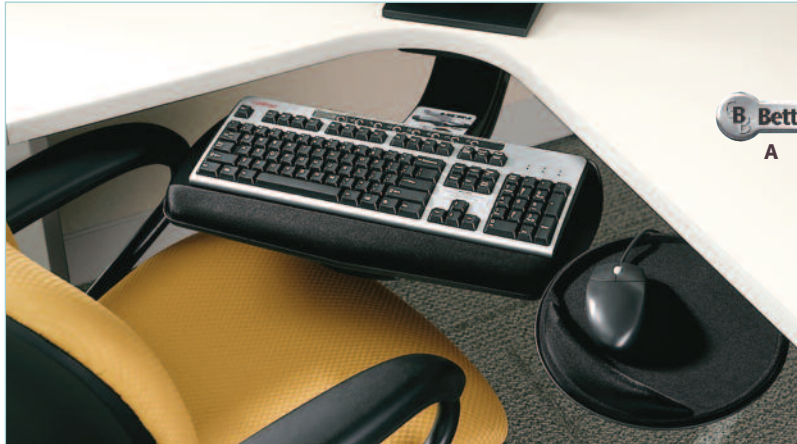
B Better A