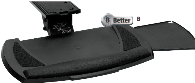
B Better B