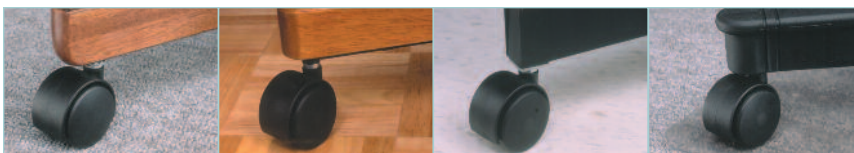
For use on carpeting: Order hard wheel casters.